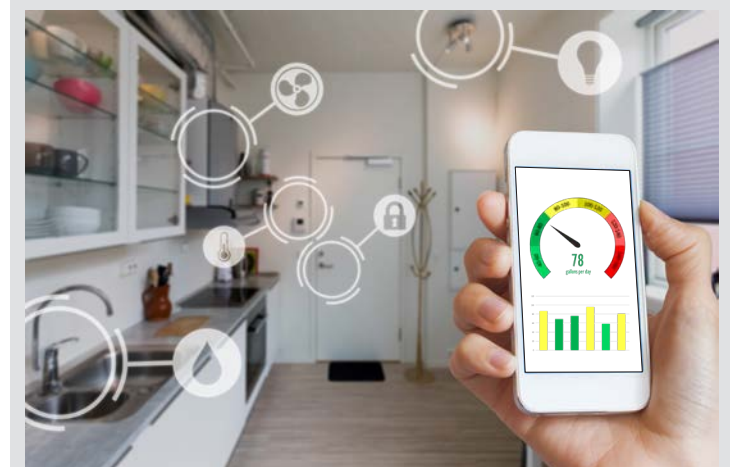
Dispense specific quantities & track water usage